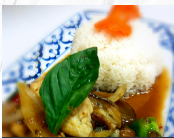
L-7 SPICY EGGPLANT