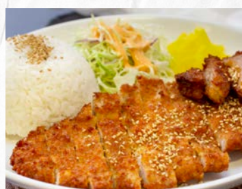
L-16 CHICKEN KATSU