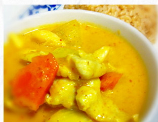
L-8 YELLOW CURRY

Yellow curry paste in coconut milk with potatoes and onions.