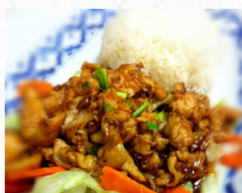
L-3 GARLIC AND PEPPER