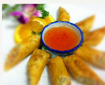
GARDEN ROLLS (3)

Deep-fried wonton stuffed with cream cheese and Imitation crab meat, served with sweet and sour sauce.