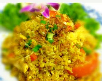
CRAB FRIED RICE