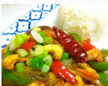
L-2 CASHEW NUT