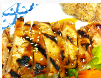
L-12 CHICKEN TERIYAKI

Deep-fried chicken cutlet (breaded crispy panko) with tonkatsu sauce.