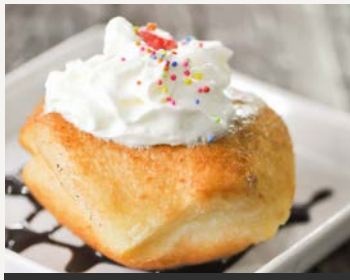
DEEP-FRIED ICE CREAM