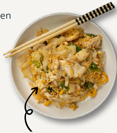
CHICKEN NOODLE (KUA KAI)

Stir-fried pasta with Thai spices, basil, onions, and bell peppers.