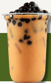
THAI TEA WITH BOBA