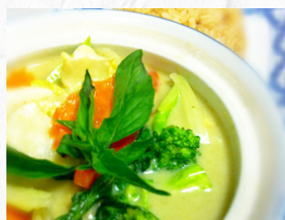
L-11 GREEN CURRY

Red curry paste in coconut milk with bamboo shoots, bell peppers, and basil leaves.