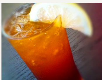
REGULAR ICED TEA