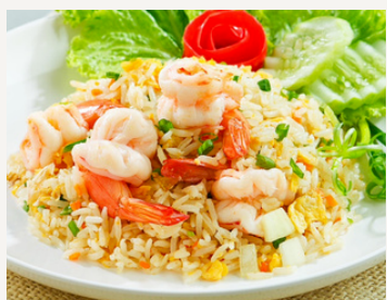
THAI FRIED RICE SHRIMP

Fried rice with shrimp, chicken, pineapple, cashew nut, onions, raisins, and egg. Seasoned with curry powder.