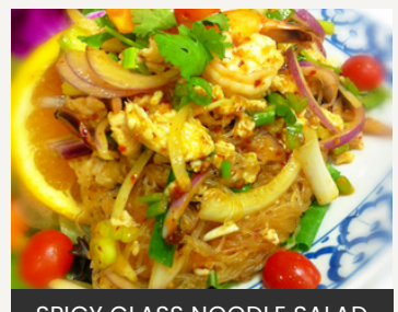
SPICY GLASS NOODLE SALAD (YUM WOON SEN)

*Spicy Dish can be mild or spicier upon request*