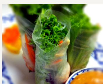
FRESH ROLL (2)