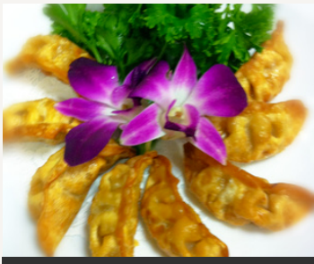
FRIED WONTON (6)