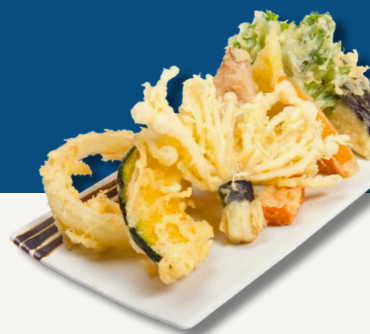
VEG TEMPURA (6)