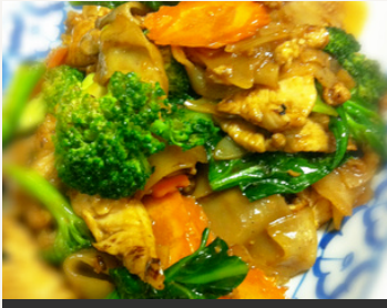
PAD SEE EW