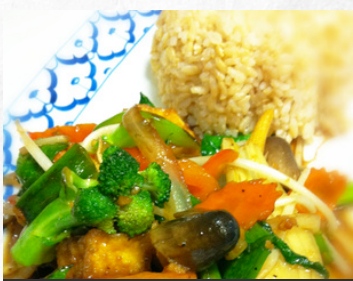
L-5 VEGGIE DELIGHT