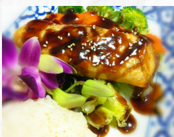
L-14 SALMON TERIYAKI