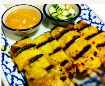
CHICKEN SATE (4)